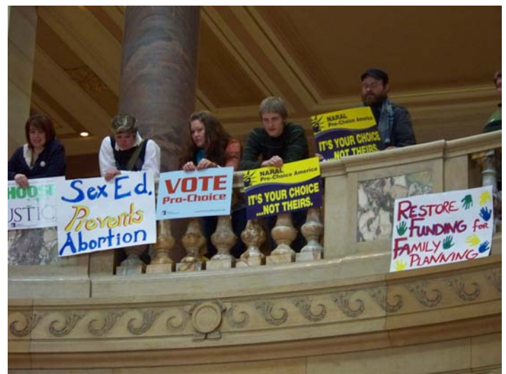
Rallyers watch from the second floor of the rotunda