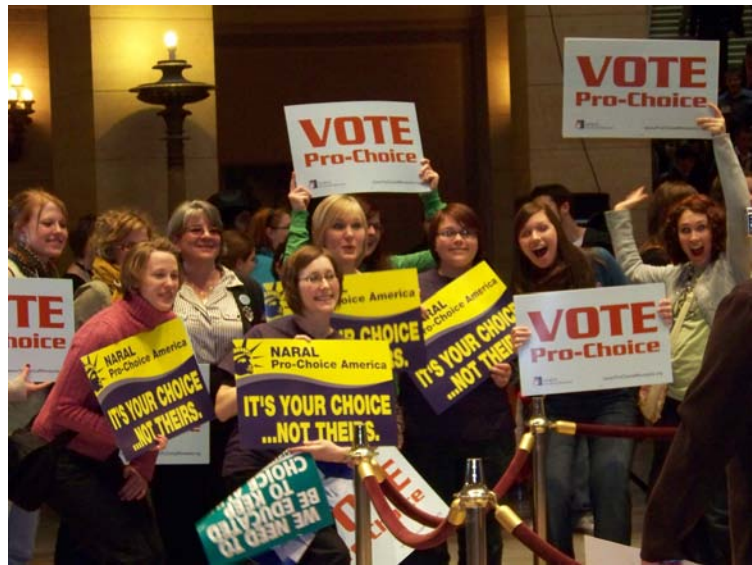
Pro-Choice rallyers waving their signs