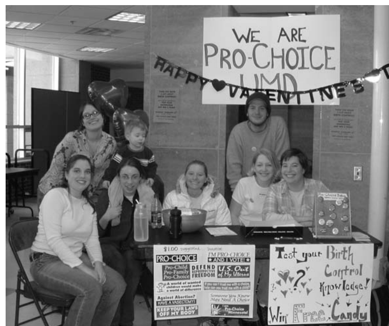
Pro-choice students at University of Minnesota-Duluth

In 2000, the Supreme Court overturned in a 5-4 decision a Nebraska abortion restriction law because, in part, it lacked a health exception. This law could allow the Court to over-rule or undermine a woman's constitutional right to protect her own health in terms of her access to safe and legal abortion. Stay tuned.