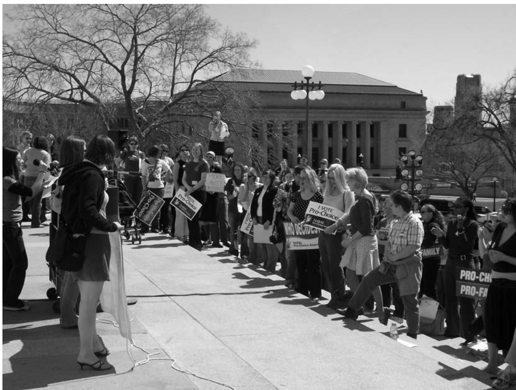
Rally on the Capitol steps during the Pro-Choice Lobby Day.

Med students and physicians have privileged access to the most private and intimate parts of a patient's life. A major part of our training as medical students is to respect this privilege and address the specific needs of our patients. In order to do this our patients must have control over their own health decisions. It is important for medical students and doctors to stand up for a woman's right to choose because choice plays a central role in delivering health care that is best for each individual.